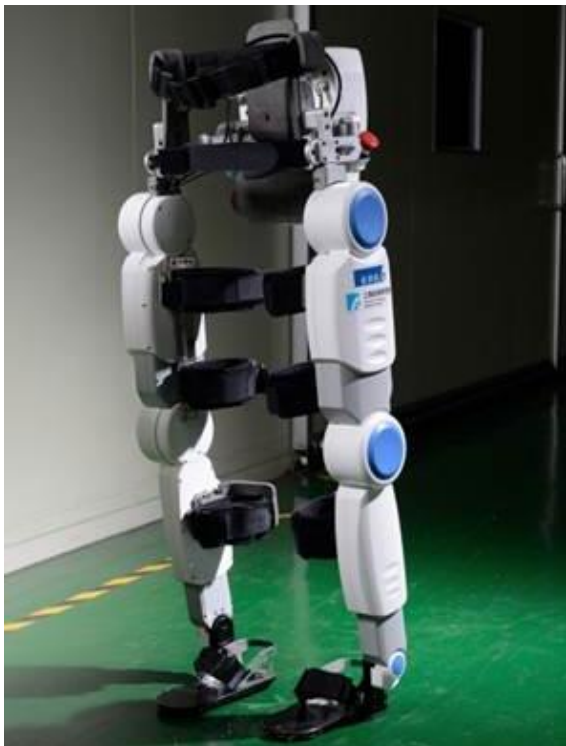
Figure 2. Exoskeleton developed by ITRI.