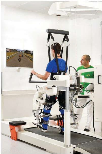
Figure 1. Lokomat, a therapeutic robot manufactured by Hocoma in Switzerland.

compensate limb mobility. The majority of the products under development are targeting at the segment of mobility compensation.